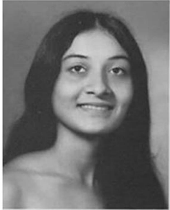
My Dearest High School Friend '73