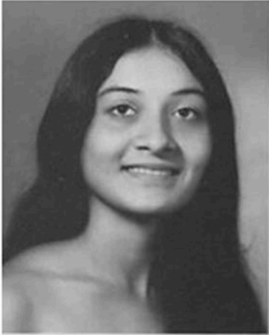
My Dearest High School Friend '73